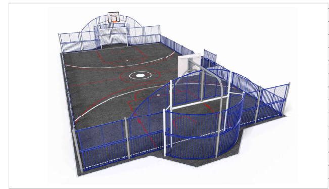
3D Overview showing MUGA and associated fence